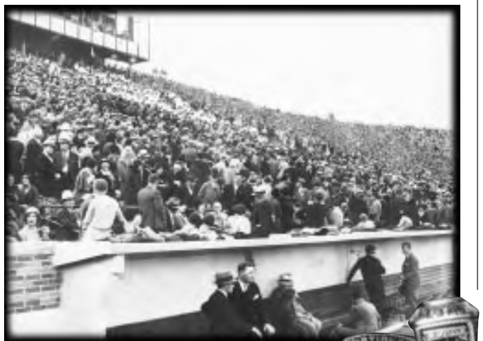
Notre Dame Stadium, 1931.

*Game cancelled because of the death of President John F. Kennedy