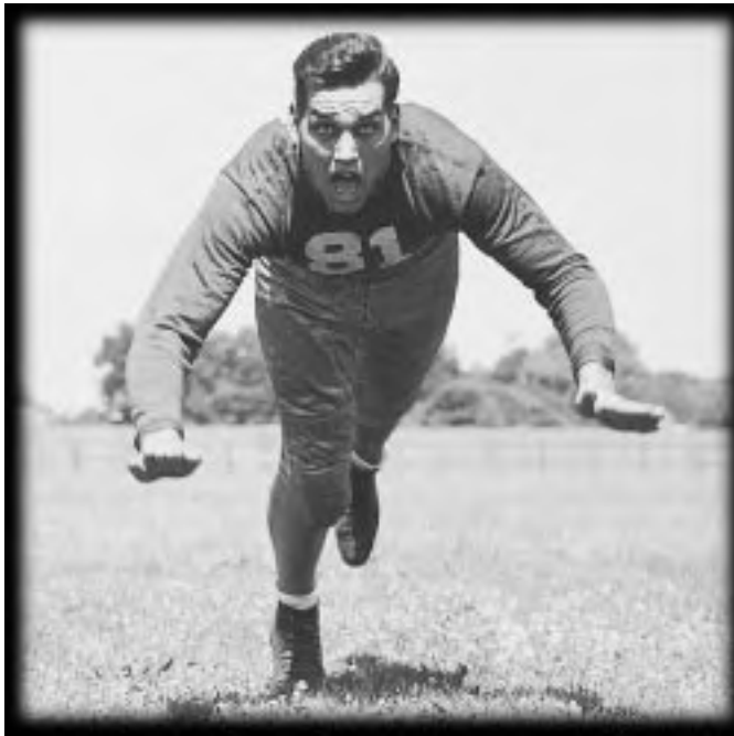
George Connor was the lone captain of the 1947 team that finished a perfect 9-0-0 and won the national championship.