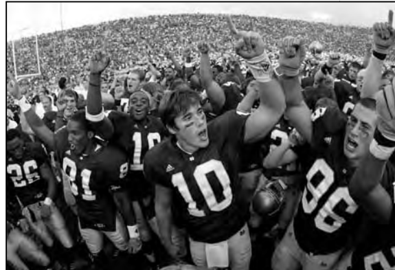
Brady Quinn (#10) celebrates with teammates following a victory over Penn State.

January 2 L (5) Ohio State (4) (Nt) (at Tempe, AZ) 20-34 N 76196