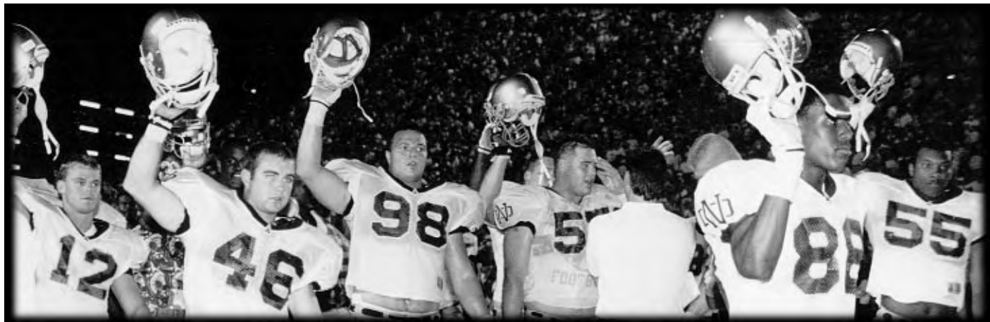
Notre Dame opened the 1996 season with a 14-7 win over Vanderbilt at Commodore Stadium. It also marked the 1,000 football game in Irish history.