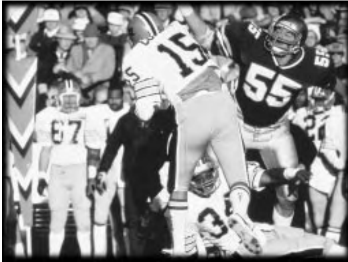
Mike Golic was captain of the 1984 Irish team.